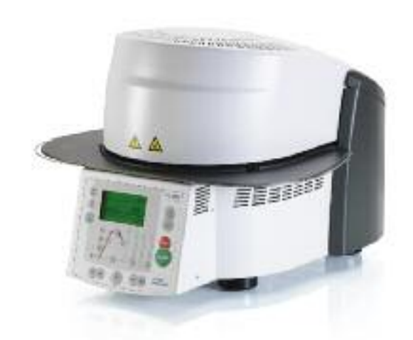
The new generation – For people who like all things practical